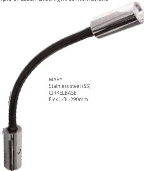
MARY Stainless steel (SS) CIRKELBASE Flex L-BL-290mm