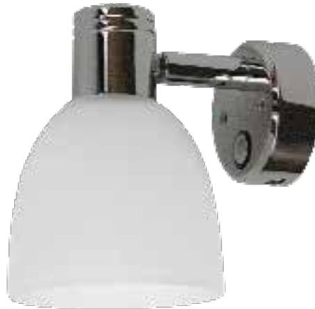
Brushed surface (SS-BR)