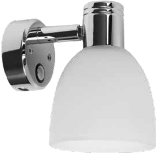
Polished surface (SS-PO)