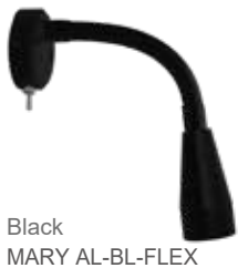
Black MARY AL-BL-FLEX