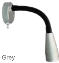
Grey MARY AL-GR-FLEX