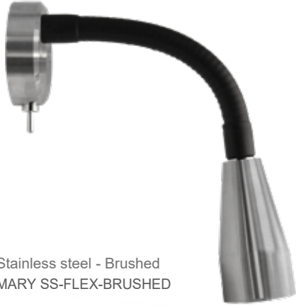
Stainless steel - Brushed MARY SS-FLEX-BRUSHED