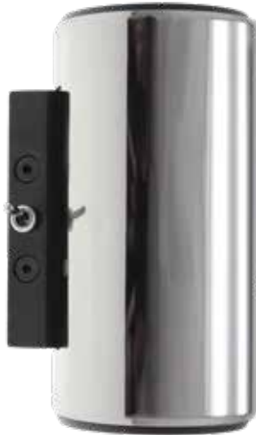
Mary Up/Down with SS Cover