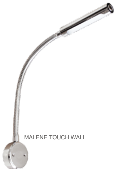
MALENE TOUCH WALL