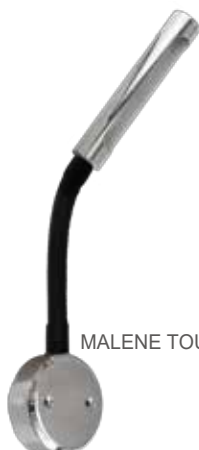
MALENE TOUCH WALL-MINI