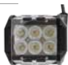
With protective lens